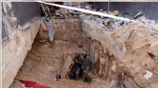
Israel-Hamas War: Israeli Military finds narrow tunnel beneath Shifa Hospital! See Photos