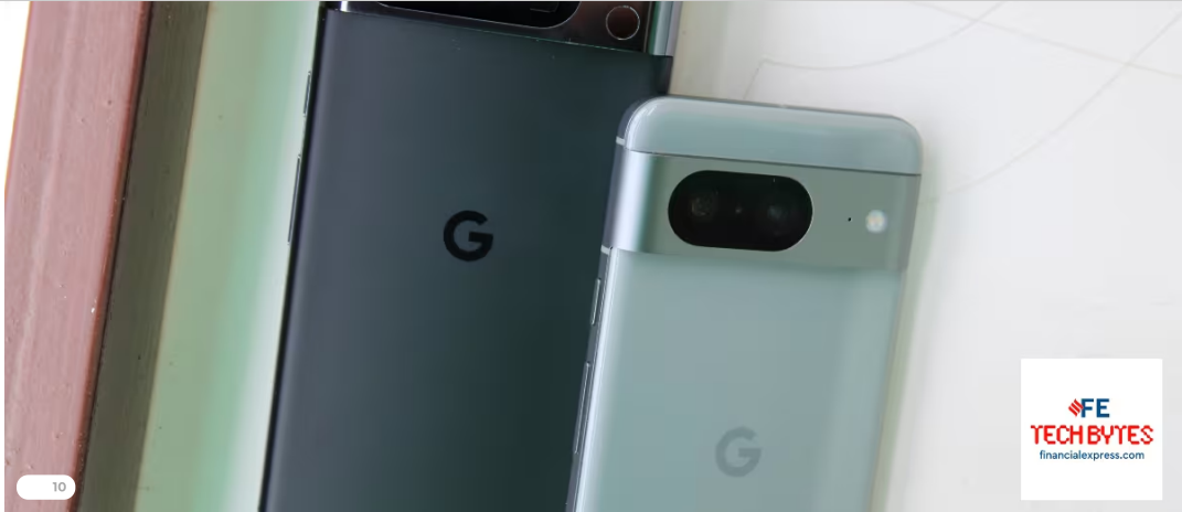
Google Pixel 8, Pixel 8 Pro in PHOTOS: Check every detail before you buy