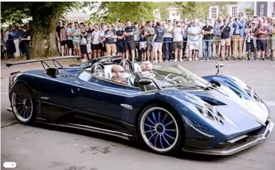
Top 6 World's most expensive cars cost over Rs 300 crores combined: Cars for the planet's richest